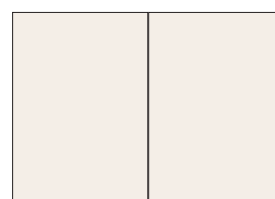
Spread*: 420x297 mm

The magazine is published by Jakt & Fiskejournalen Sverige AB