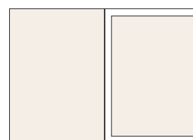
1/1 page bleeding size*: 210x297 mm 1/1 page setting area: 180x267 mm Cover 4*: 210x270 mm